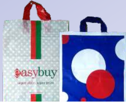
SOFT LOOP HANDLE BAGS