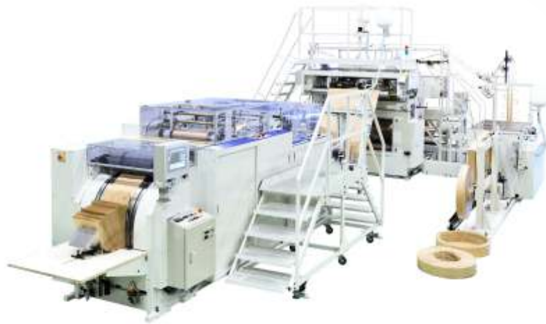
Twisted Handled Bag Machine