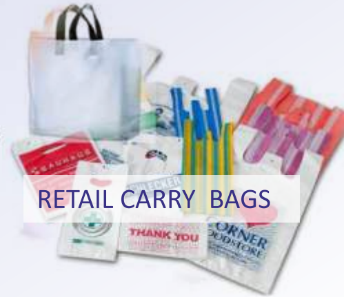
RETAIL CARRY BAGS