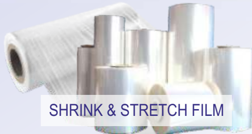
SHRINK & STRETCH FILM