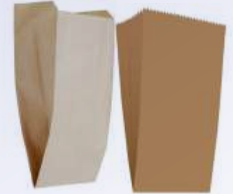
V BOTTOM BAGS