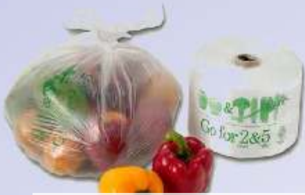
F&V BAGS ON ROLLS