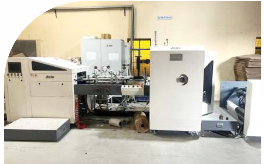
V - Bottom Bag Machine