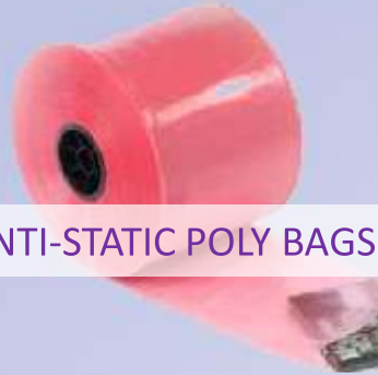
ANTI-STATIC POLY BAGS